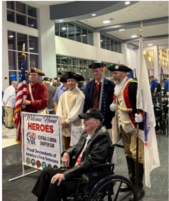
Posing with a World War II Vet