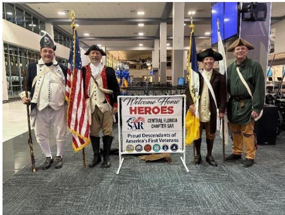
MAY 28 – This Honor Flight was at the Sanford Airport. Due to mechanical issues the flight didn't arrive until 11:15, but it was well worth the wait to be able to greet the 66 heroes.

Mission #67 – Wednesday, October 1 - Allegiant Mission #68 – Wednesday, October 29 – Allegiant