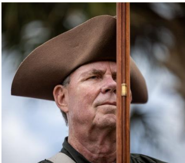
49 th Chapter President (2025 – 2027)