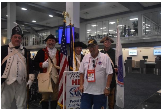
MAY 28 – More photos with the Heroes as they arrived at the Sanford International Airport