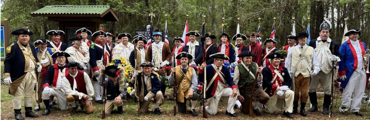
The Battle of Thomas Creek