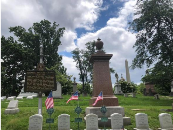
George Rogers Clark memorial at Cave Hill Cemetery in Louisville. It includes markers and flags placed by the SAR & DAR.