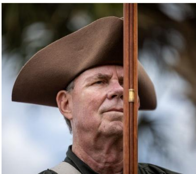
49 th Chapter President (2025 – 2027)